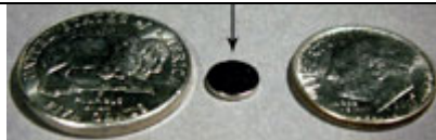
M-4 small magnet

1/2" L x 1/2" W x 1/32" Thickness, wt. 0.96 grams, Item M-17 $1.49 ea.